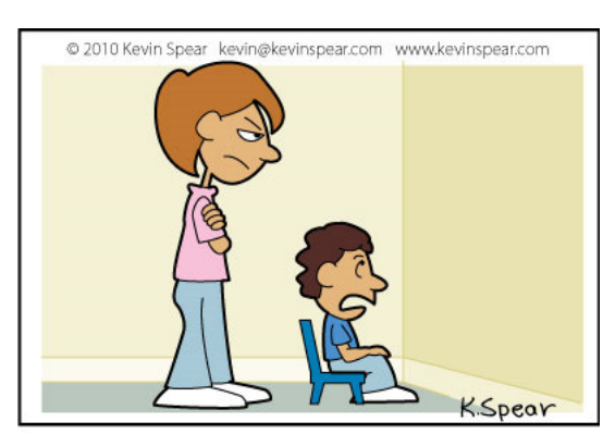
"I have thought about my actions and realize my desire for instant gratification clouded my judgment."

The question for you in this lesson is: How does our heavenly Father treat us when we sin?!? How does He parent us?